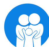
EARLY CHILDHOOD DEVELOPMENT