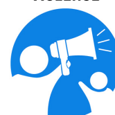
YOUNG PEOPLE DRIVING CHANGE