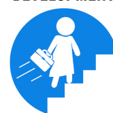
SKILLS AND DECENT WORK