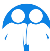
SEXUAL AND REPRODUCTIVE HEALTH AND RIGHTS