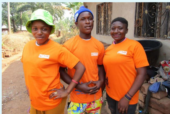
Youth group members take part in 16 Days of Activism

Community members and religious leaders also took part in the 16 Days of Activism, helping to strengthen the call for peace and protection during this difficult time.