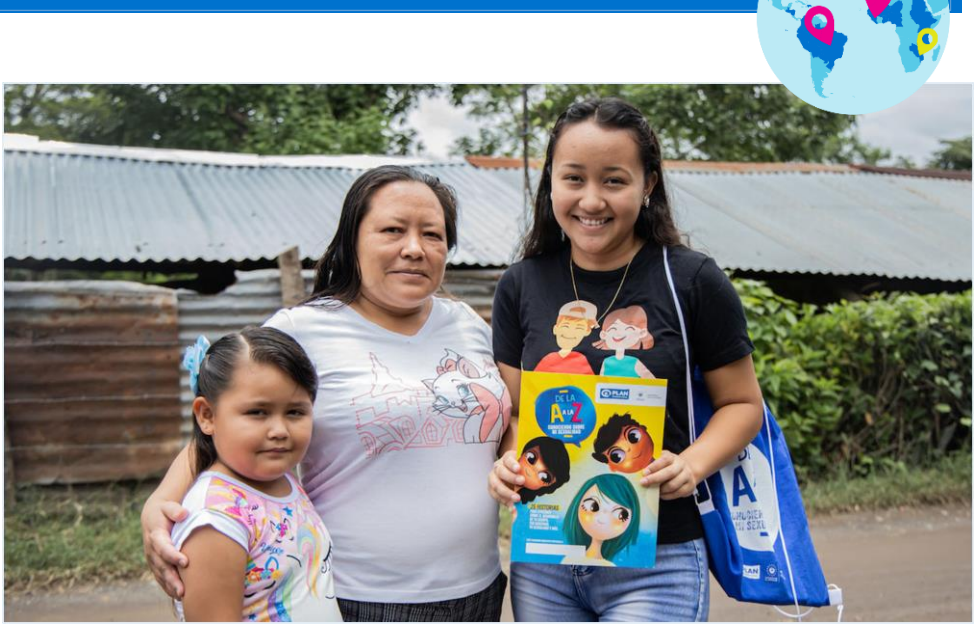
Your support helps girls and boys to stand up for their futures.

-Girls in La Libertad are vulnerable to gender-based violence. We will collaborate with community leaders to create formal Community Child Protection Mechanisms.