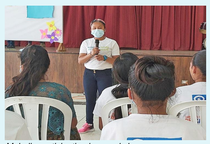
Mabelin participating in a workshop

As a result, teachers and parents in Mabelin's community see the importance of girls' education, and help to advocate for equality.