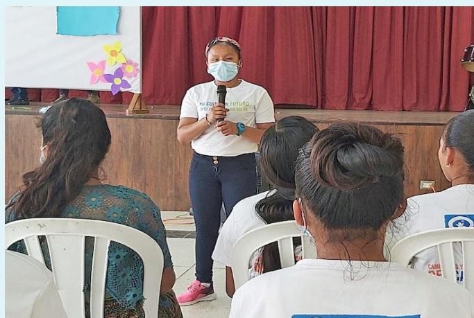
Mabelin participating in a workshop

As a result, teachers and parents in Mabelin's community see the importance of girls' education, and help to advocate for equality.