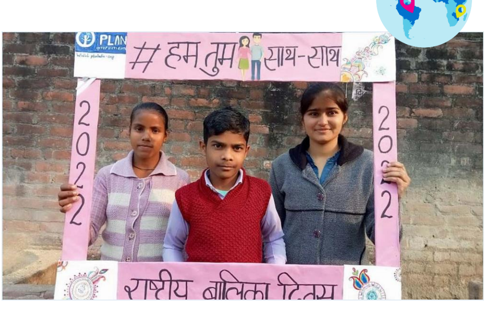
Your support helps girls and boys to stand up for their futures.