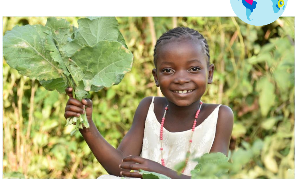
Your support helps children to stand up for their futures.

Of girls ages 15 to 19 in Homa Bay are married