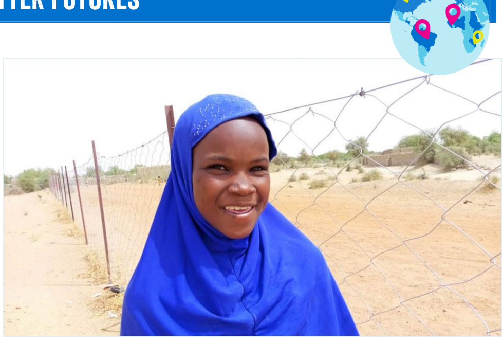
Your support helps girls and boys to stand up for their futures.