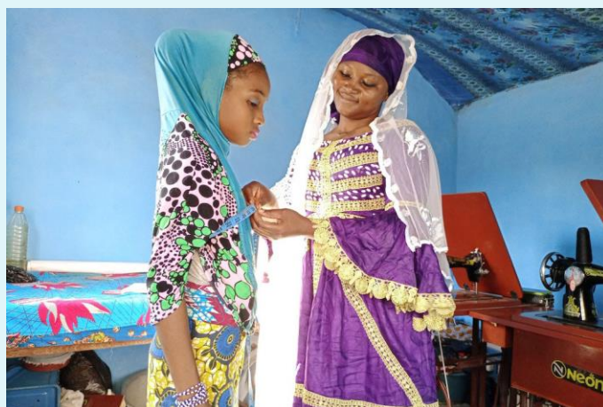
Taking measurements to sew a dress