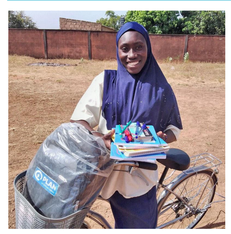
Young woman participating in Plan's initiatives.