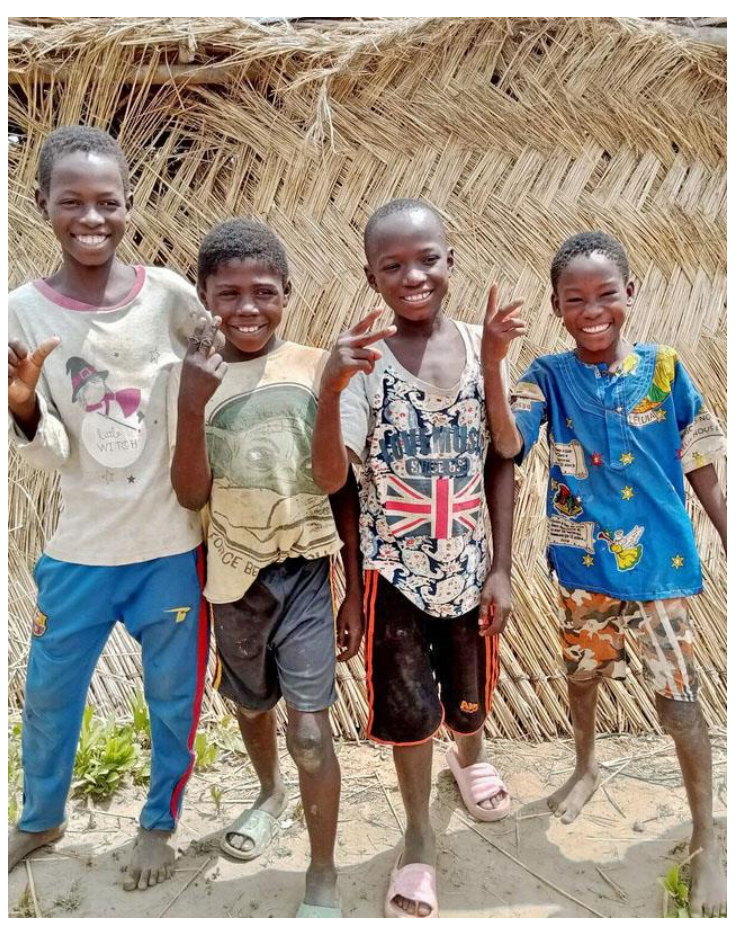
Children participating in Plan's programmes.