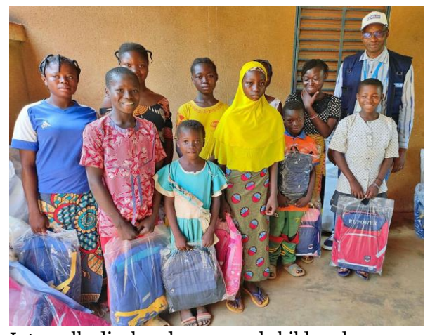
Internally displaced sponsored children happy to receive school kits.

Students benefitted from remedial classes