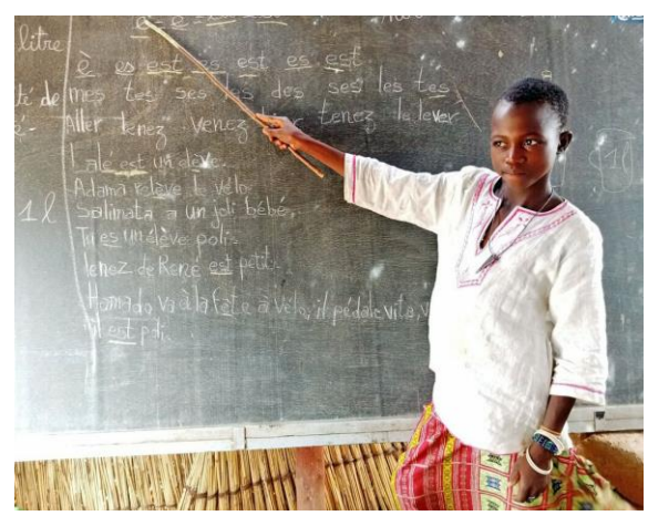
Teachers educating the students in schools.

This year, 281 children, including 144 girls, gained access to quality education through 10 newly established bridging centres. Furthermore, 25 students with visual impairments, including nine girls from AEMAG Boarding School, Sacré-Cœur School, and the provincial high school, received essential support such as food, specially designed educational supplies, and uniforms.