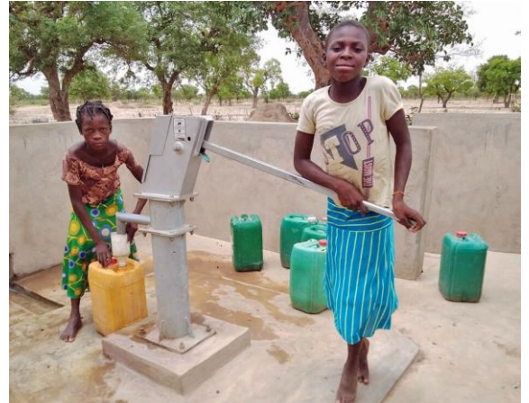
Children taking water from their school borehole.

To raise awareness about menstrual health and hygiene in schools, 30 teachers and staff have been trained in menstrual hygiene management, enabling them to better support and supervise students, especially young girls.