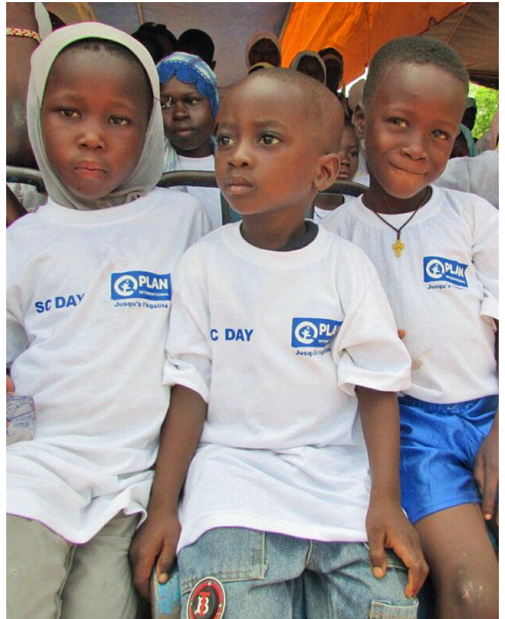
Children participating in Plan's initiatives.