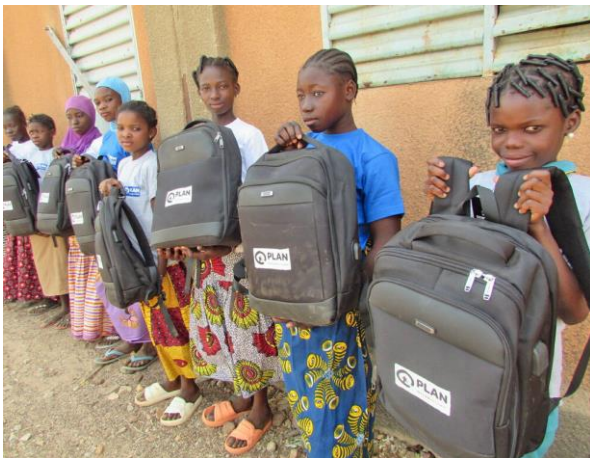
Children happy to receive their academic excellence prizes.

girls improved menstrual hygiene with hygiene kits.