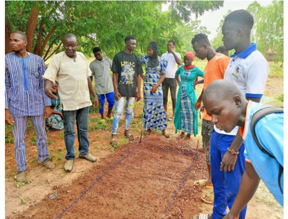
A training session on soilless farming techniques.

To help children and women cope with post-traumatic stress after crisis, Plan has developed a psychosocial support area. This area includes play and stimulation materials (multi-sensory stimulation), display support, and a shed specifically for malnourished children, their mothers, and pregnant women.