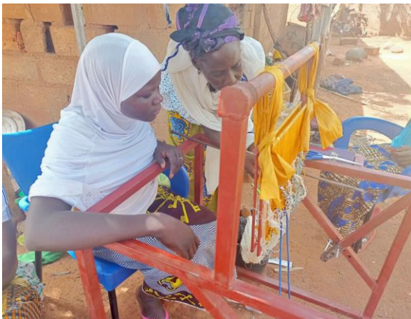
Traditional cloth weaving training session.

families were provided with soilless farming kits