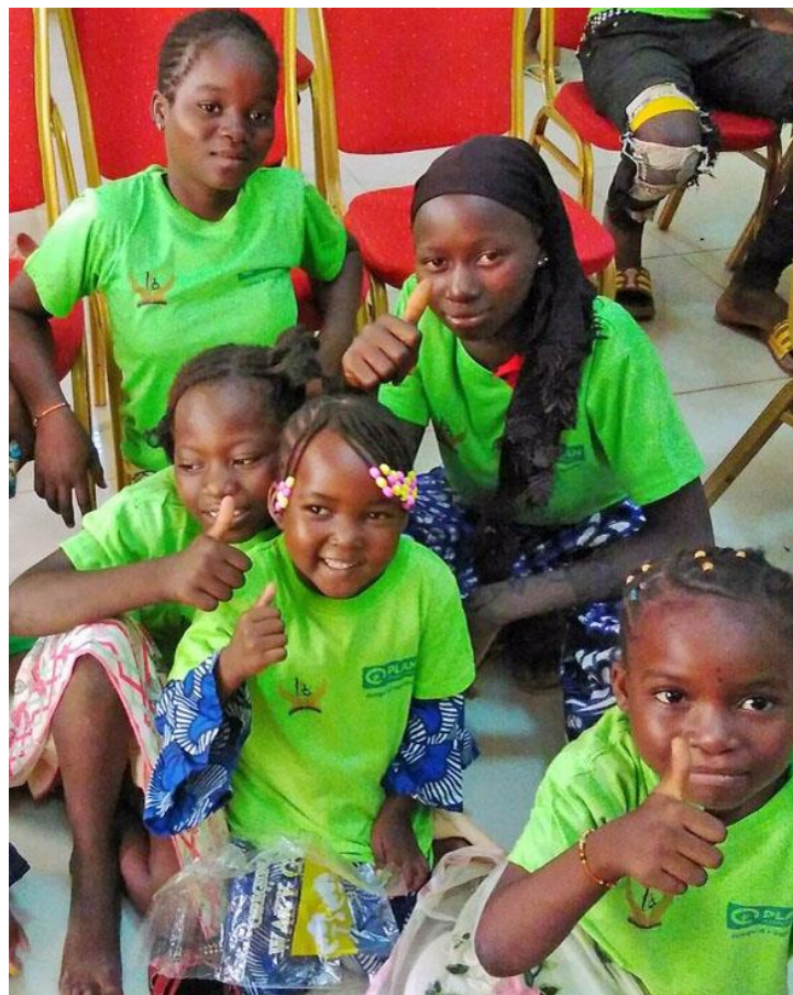
Children participating in Plan's programmes.