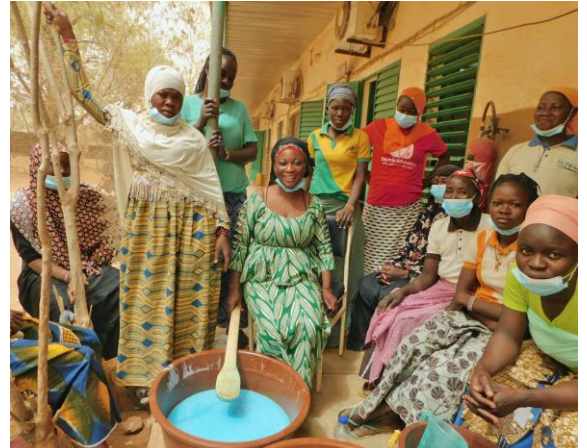
Women participating in soap-making workshop.

30 young people, including four girls were trained in solar energy to diversify their sources of income and contribute to their economic empowerment.