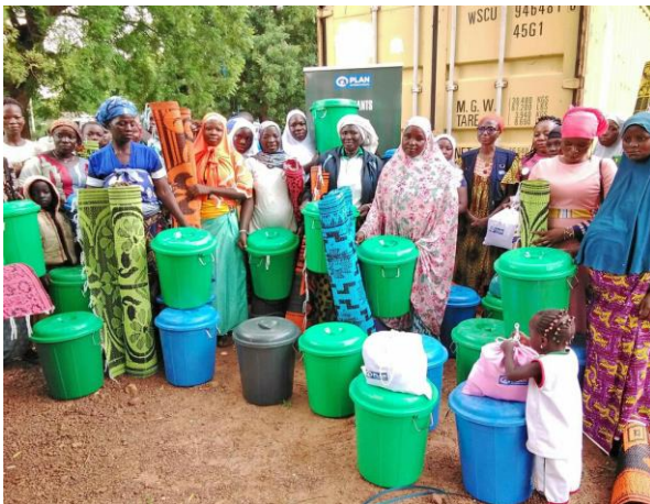
Women receiving hygiene and dignity kits.