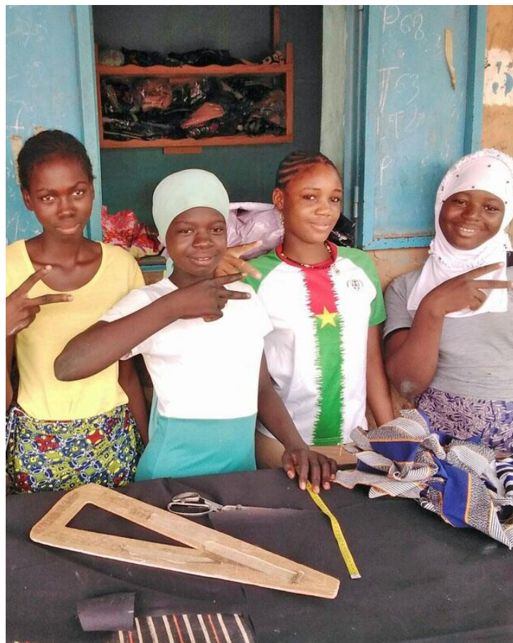
Girls participating in a workshop.

In collaboration with the community and government, Plan aims to strengthen employment opportunities for young people, especially young women and people with disabilities. As part of economic empowerment initiatives, we trained 54 village agents including 36 women in the Village Savings and Loans groups methods to improve their skills for entrepreneurship and business innovation.