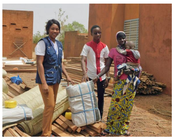
An internally displaced person (IDP) receiving a shelter kit.

Additionally, Plan provided 125 households out of which 60% are women and girls with soilless production kits and improved seeds to support sustainable agriculture development.