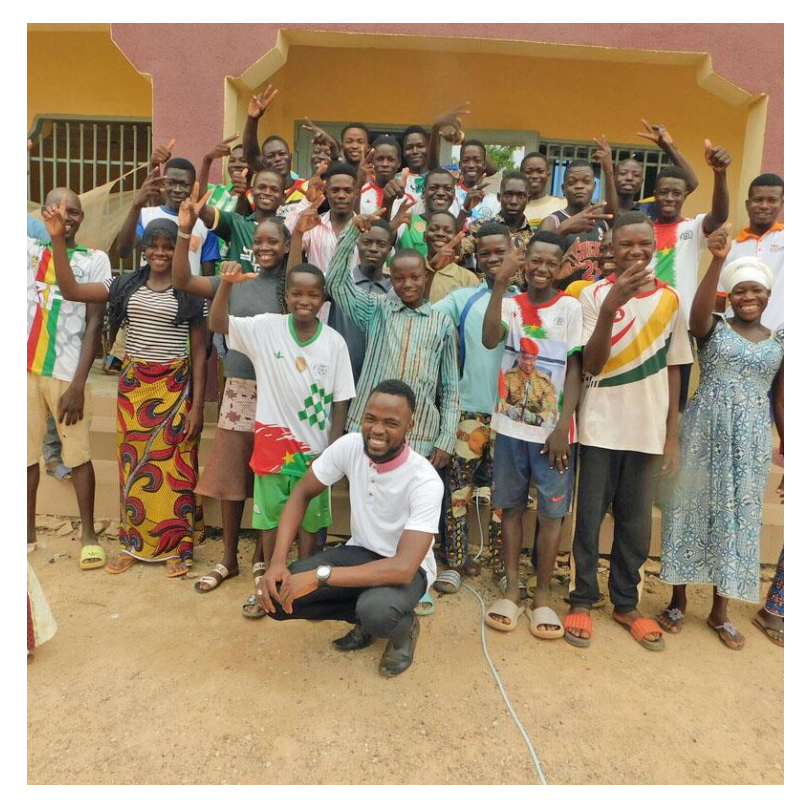
Children participating in Plan's initiatives.