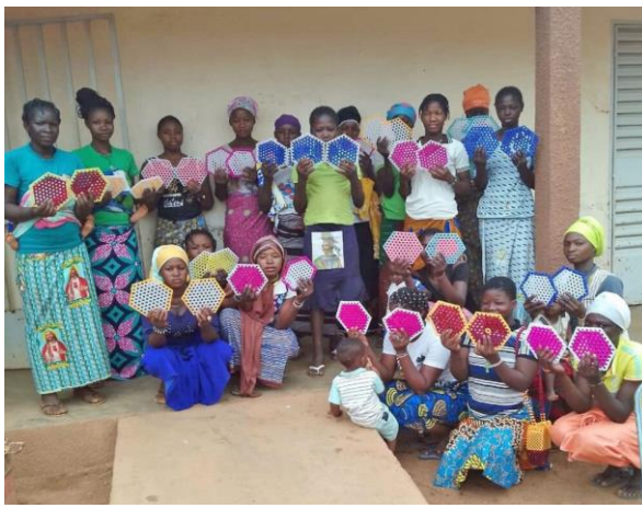
Girls trained on beadwork showing their products.

100 household kits were distributed to female IDPs