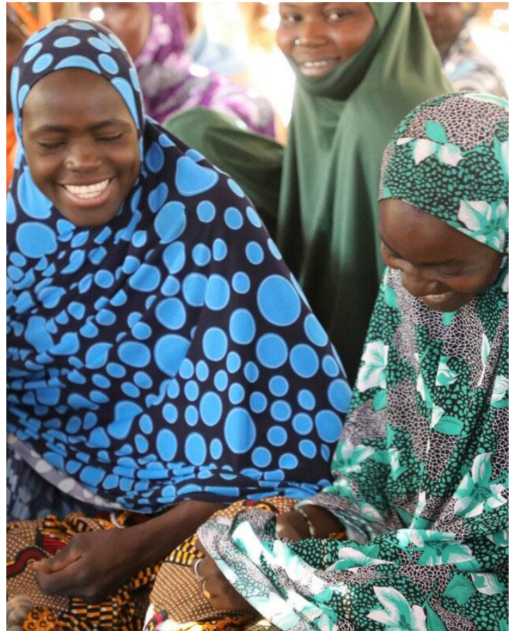
Women participate in youth savings and credit groups.