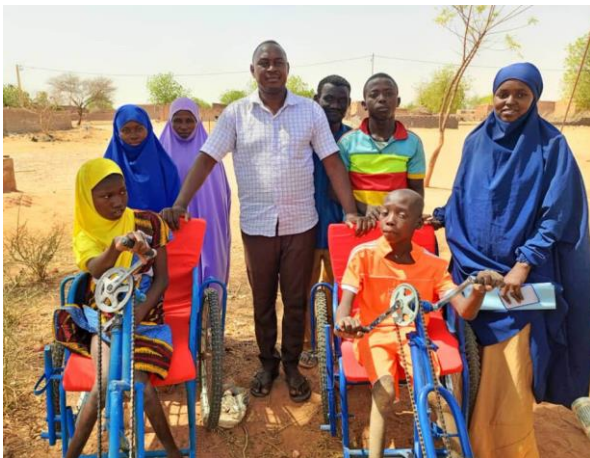
Members of local committee provide tricycles for children with disabilities.

Community members facilitate the TB project