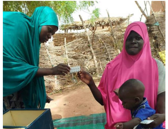
A mother receiving chemoprophylactic tablet.

With special provisions Nigerien women too can access the screening with ease. 4% of the people infected by tuberculosis are also HIV positive in Dosso. We support girls and young women who are at most risk of exposure to HIV and tuberculosis with service providers, and take steps to provide sexual and reproductive health and rights services that are quality, adolescent-friendly, gender-sensitive and inclusive.