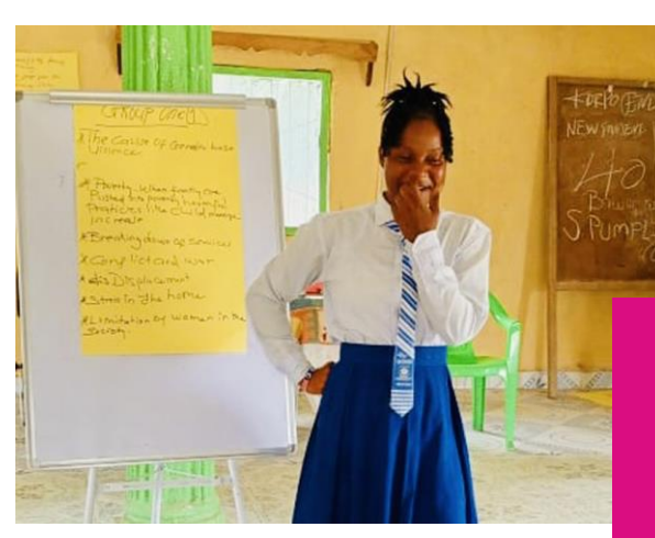
Theresa advocates for children's rights in Lofa.