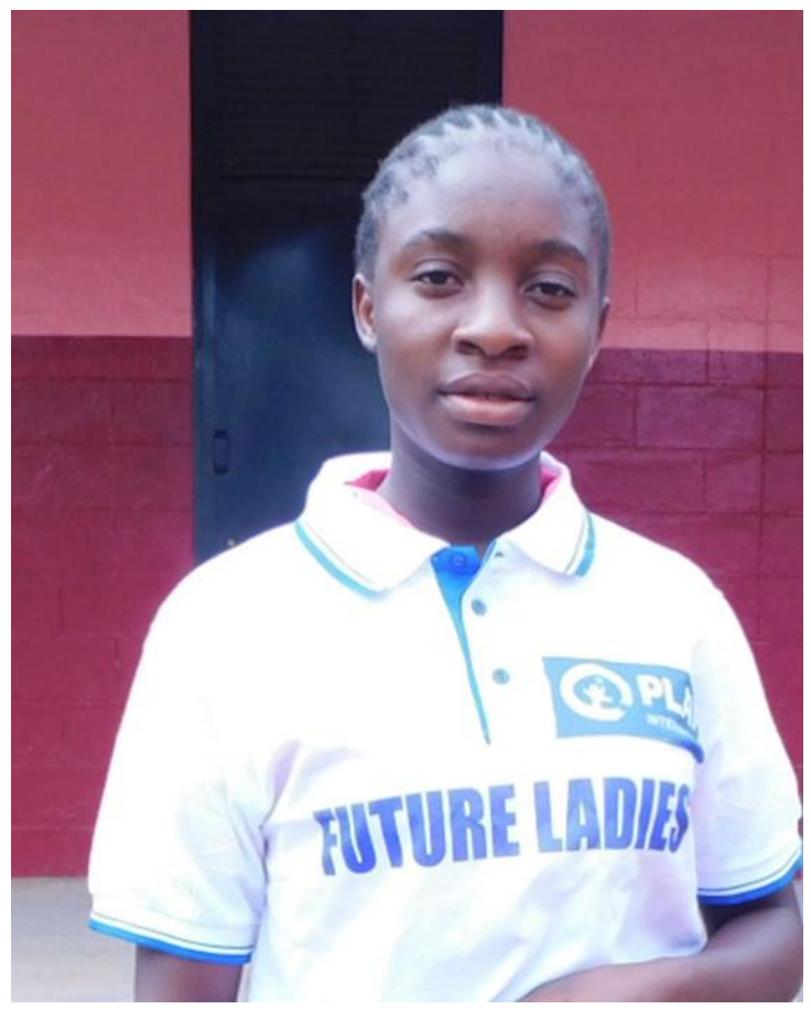
Girl participating in Plan's gender equality programme.