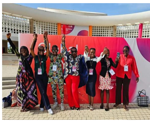
Young girls advocating for feminist leadership and girls' empowerment.

As a result, girls and young women feel empowered to manage their health and safety, boosting their well-being and positively impacting their communities.