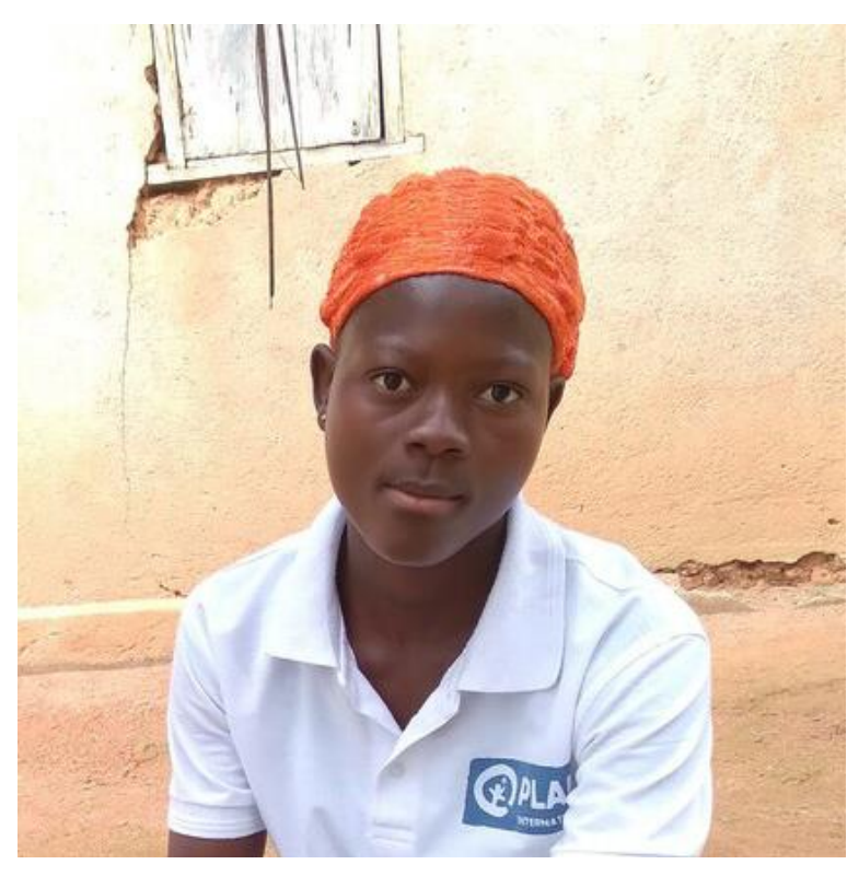
Children participating in Plan's training programmes.