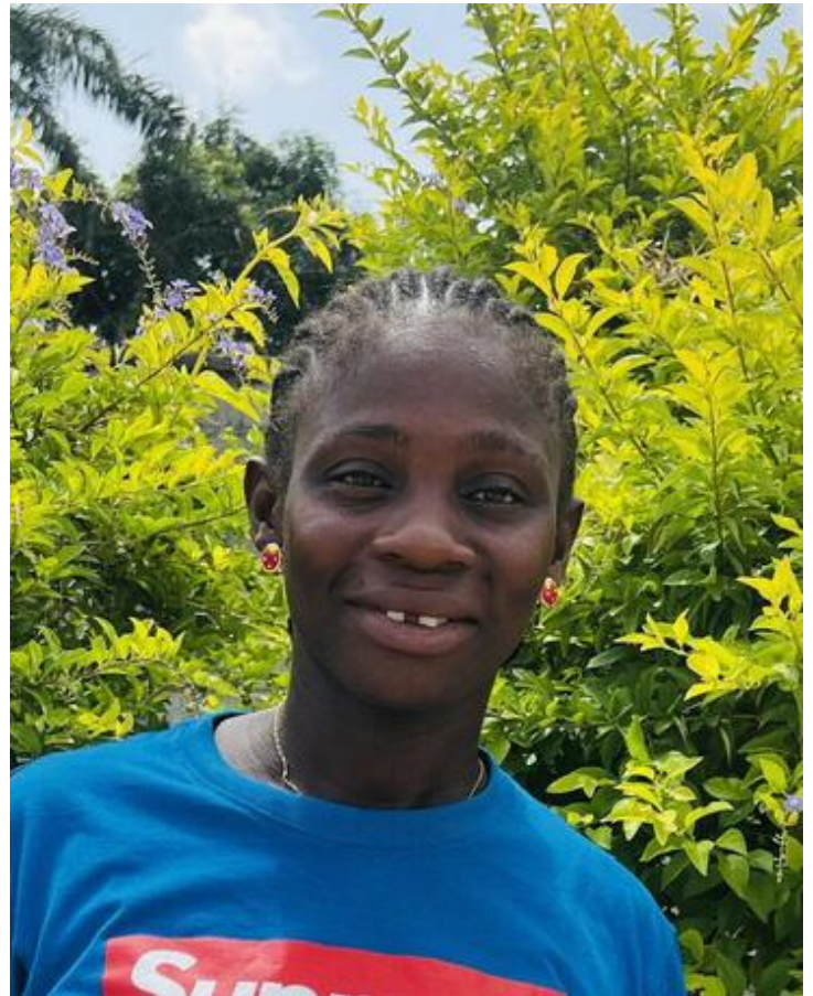
A parent of a Sponsored Child in Bomi.