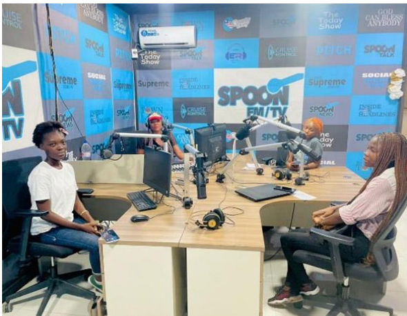
Young girls leading an awareness and advocacy campaign at the radio station.

hygiene kits were provided to young girls aged 12 to 17