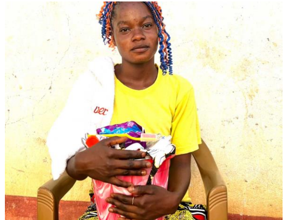
Sponsored Child participating in the distribution of hygiene kits in Bomi.

As part of our initiatives, we have conducted awareness campaigns on the importance of girls' education with schools targeting young people including 110 girls and 12 boys. Additionally, 38 Water, Sanitation, and Hygiene (WASH) committee members strengthened their knowledge on improving access to safe drinking water, sanitation, and hygiene practices for women and young girls in Bomi.