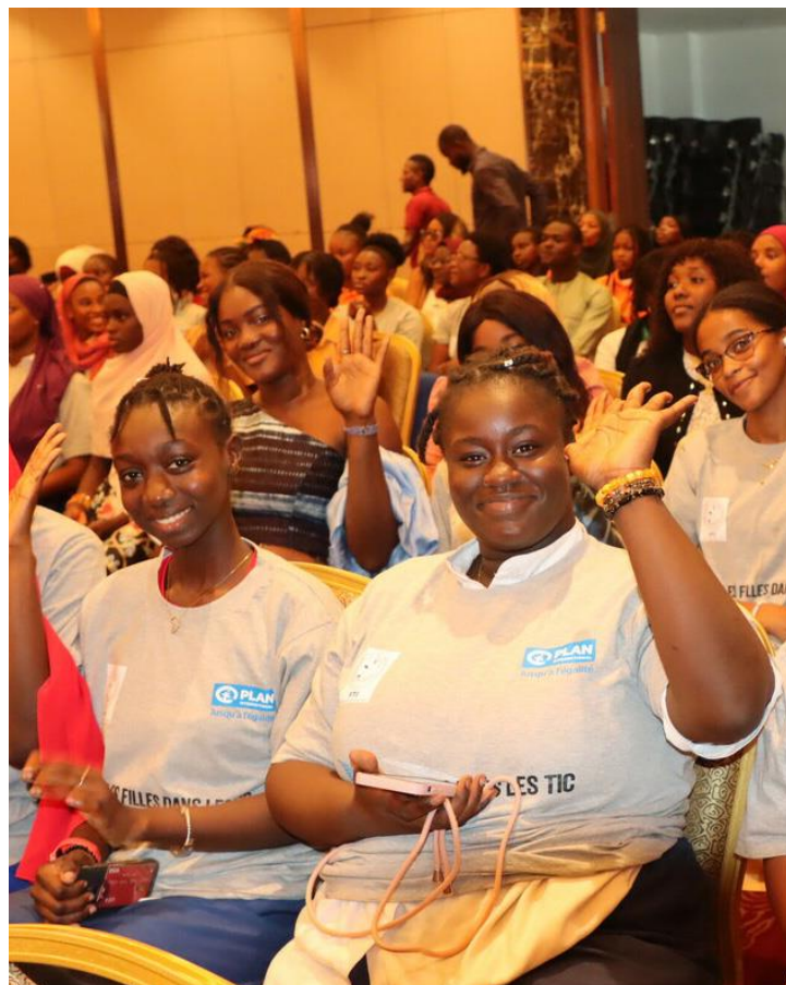
Youth participants at Labour Day celebrations.