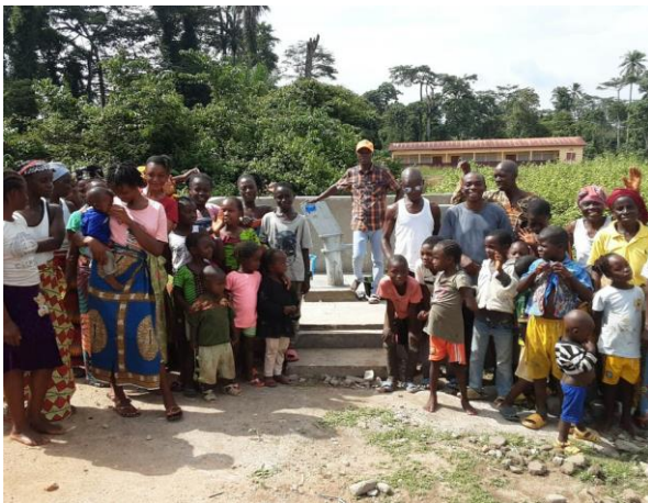
Local community in Macenta who have access to clean water facility with their new borewell.

students mobilised by youth organisations