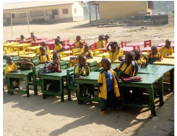
Pre-school students with their new furniture at the drop-off facility.

Together, the communities are fighting against the exploitation of children by participating in talk sessions and learning about their consequences. These key initiatives have supported young girls and children with disabilities in accessing better equity and equality in getting access to opportunities to improve their lives.