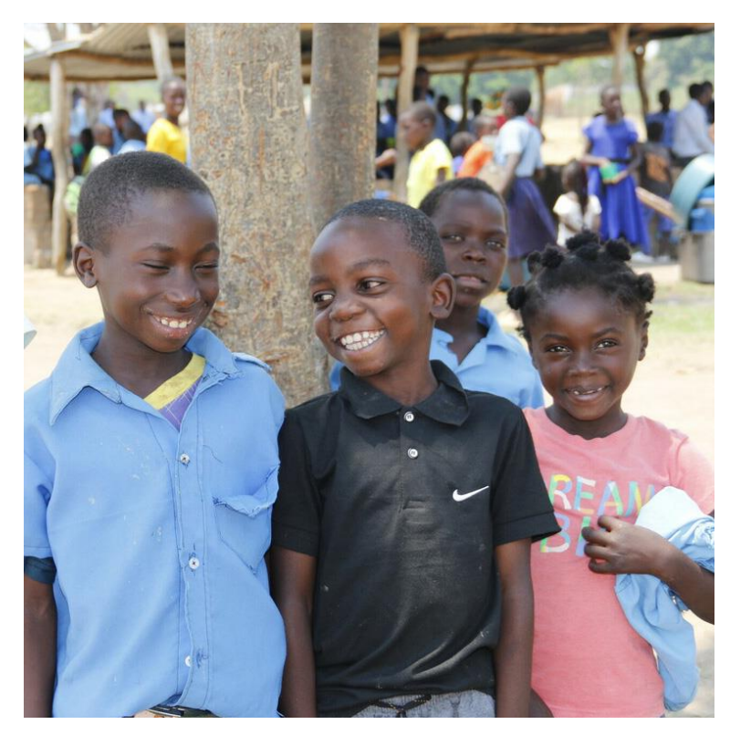
Plan International's Open Day brings sponsored communities to gather, shape and build their future together.