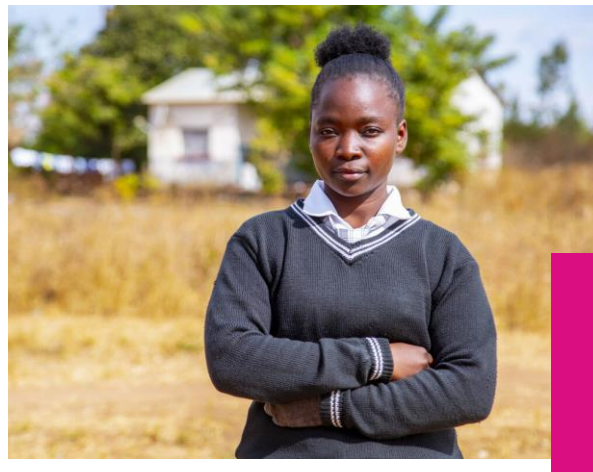
With basic needs met, Precious and her peers can now focus on their education.