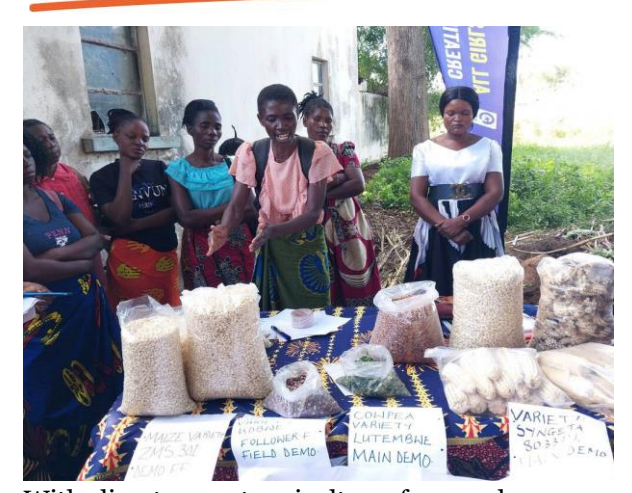
With climate smart agriculture, farmers have an increased output, ensuring food and financial security.

youth now have the tools to generate more income