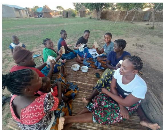
Members of the saving groups gather to make financial decisions.

Through Pass on the Gift and Plan's Savings for Wealth Creation model, 120 young people have built livestock farming and entrepreneurial skills. Leaders and stakeholders have also identified some of the next steps in ensuring that young girls continue their schooling, and youth are engaged in meaningful employment.