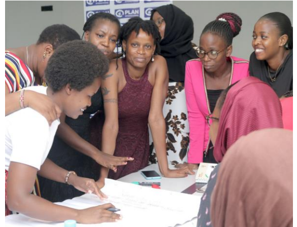
Young advocates participate in leadership training session.

Additionally, 724 young men can now challenge gender-based violence. Through intergenerational dialogues and discussions with families, we are continuously challenging harmful societal and gender norms in Kwale.