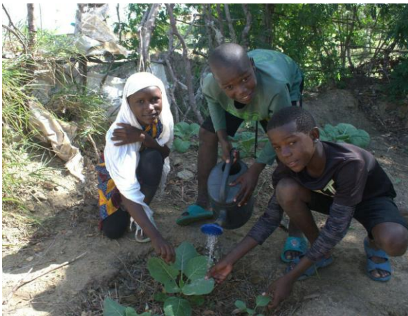
School children attending to their crops in school.

1,200 fathers engaged in intergenerational dialogues