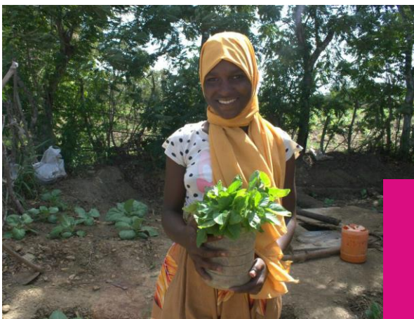
Climate-led technologies help create food security in Kwale.