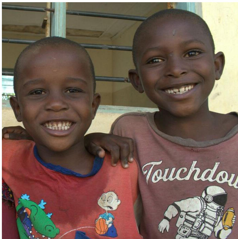
Children participating in one of Plan International's activities in Kwale.