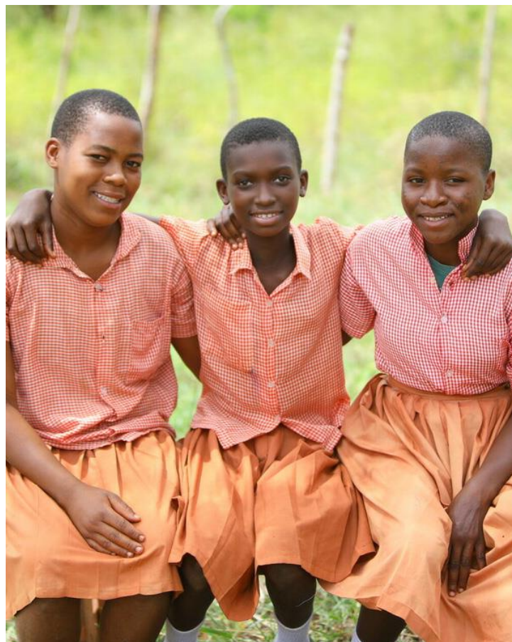
Cash transfer programmes improve school retention.