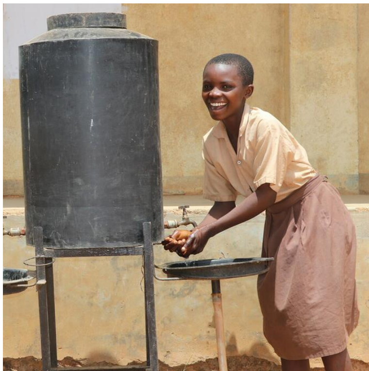
A student using the new handwashing facilities at her school.