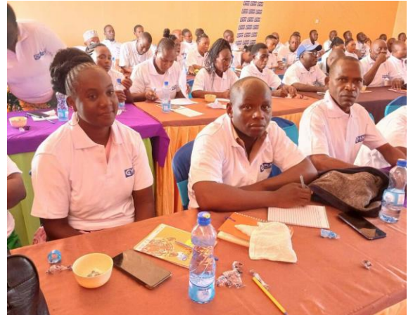
Teachers receive training on teaching life skills.

Plan also held workshops with local families to sensitise them against harmful cultural norms and practices. Sustainable change begins when the entire community is involved.