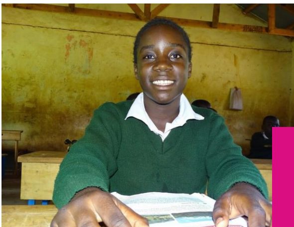
359 pupils were supported with school fees to complete secondary education.

The project also addresses menstrual hygiene challenges faced by adolescent girls, which can disrupt their education. By ensuring access to basic hygiene necessities, we help empower girls to manage their needs and continue their education without interruption, supporting them in reaching their full academic potential and pursuing their aspirations.