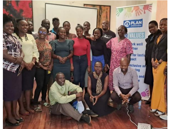
Parents participating in a training session on child protection.

To further promote gender equality and inclusion, we engage young people in creating spaces for dialogue on gender relations, encouraging them to play a positive and active role in driving social change.