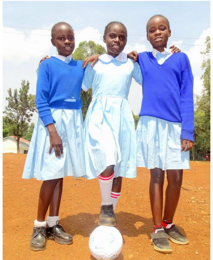
Sports programmes improve confidence and self-esteem.