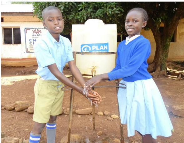
A better school infrastructure improves pupil retention.

Community volunteers gained skills in planting equality