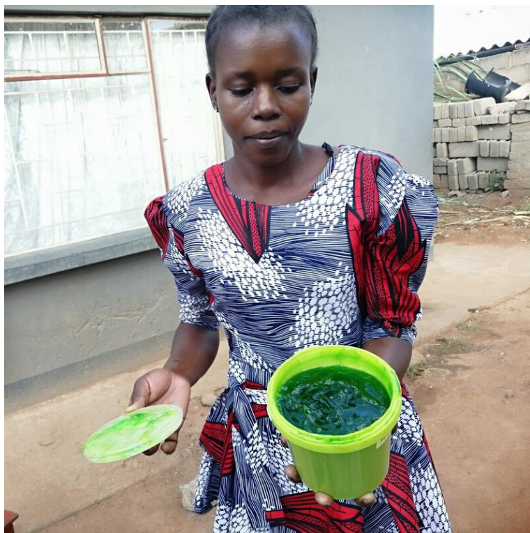
Training programmes for women empowerment in Chiredzi.