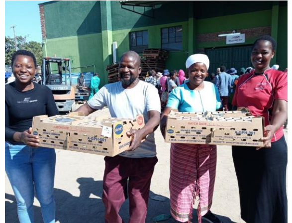
Training programmes about women empowerment in Chiredzi.

95% of our urban resilience-building participants are women. This focus helps empower them in household food consumption decisions and addresses their specific needs, such as access to sanitary products.