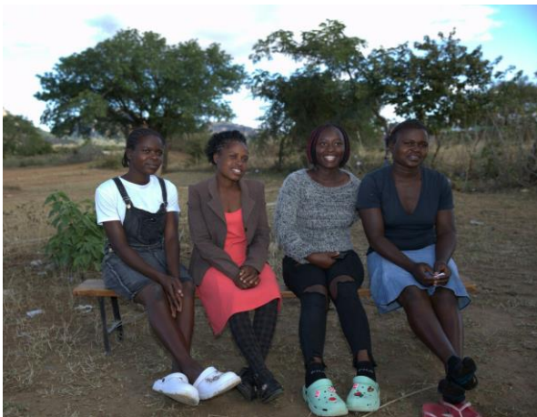
Champions of Change club from a school in Chiredzi.

families received starter kits for making detergents