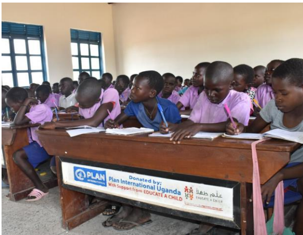
Students in a classroom furnished with desks, as part of Plan's Rising Project.

youth trained in HIV testing and counseling services