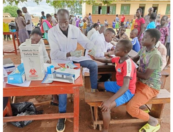
Children undergoing medical screening during a health camp in Northern.

We supported 24 young mothers with information on menstrual hygiene, family planning, and sexual health, boosting their confidence and helping them recognise the risks of gender-based and sexual violence.