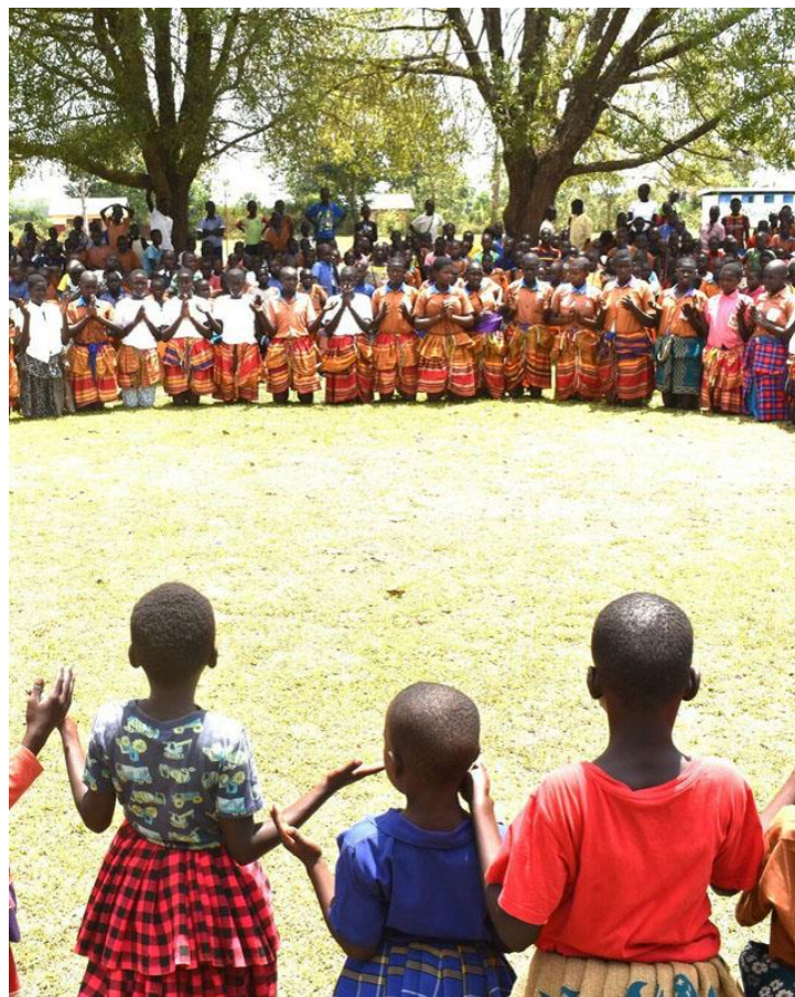
Children participating in extracurricular activities.