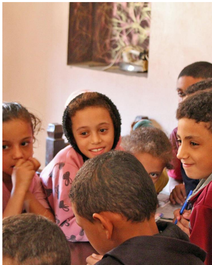
Children participating in a workshop on child protection.