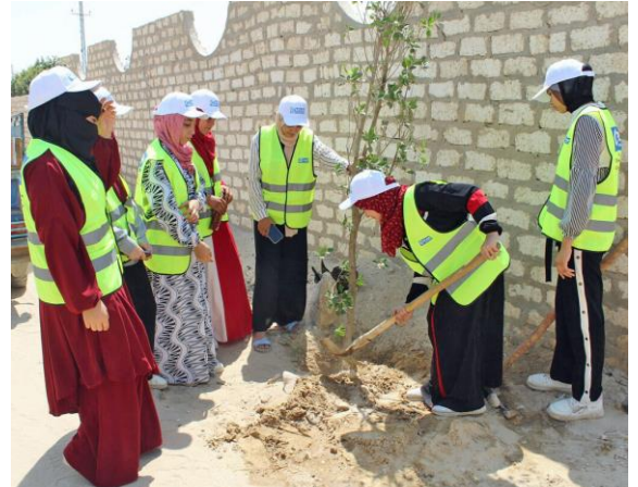
Girls Lead members participating in a 100 Million Trees initiative.

540 adolescents have participated in peer-to-peer education about their reproductive rights, helping to reduce the stigma around these conversations and gain community support. The Y-Adapt programme, a game-based curriculum, engages and empowers youth to take action within their communities to adapt to climate change. Boys and men are also expanding their knowledge, advocating for positive masculinities and supporting gender equality initiatives. With growing confidence and self-esteem, more young people are stepping into leadership roles, further amplifying their impact on society.