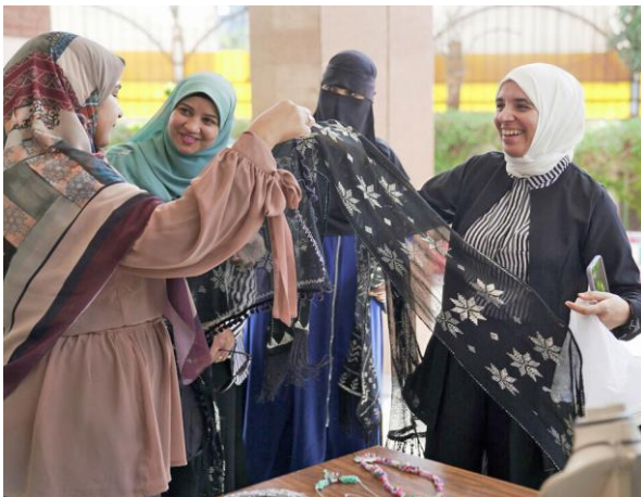
Young entrepreneurs showcase their products at local fairs.

girls have improved agency over their life decisions