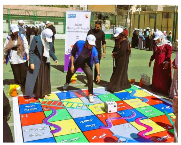
Women participating in a recreational activity during International Women's Day.

By enhancing the community's knowledge and skills, this initiative aims to create a safer, more supportive environment where children can thrive.