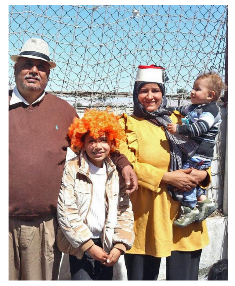
Family camps offer various recreational activities.

For example, through vocational training and skill development projects, families now have access to extra income. Family Camps enable parents and children to spend quality time together. Young girls are joining the workforce, combating gender-based violence like FGM and child marriage, and striving to create gender equality in the region.