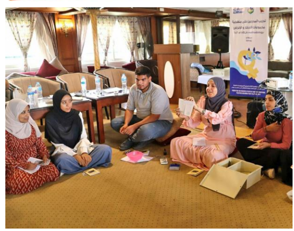
Training of Trainers on Village Saving and Loan Associations.

children participate in Aflatoun sessions