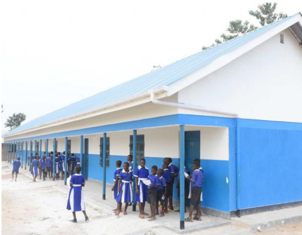
Classroom block constructed by Plan in one of the schools in the sponsorship community.

teenage mothers trained in menstrual hygiene