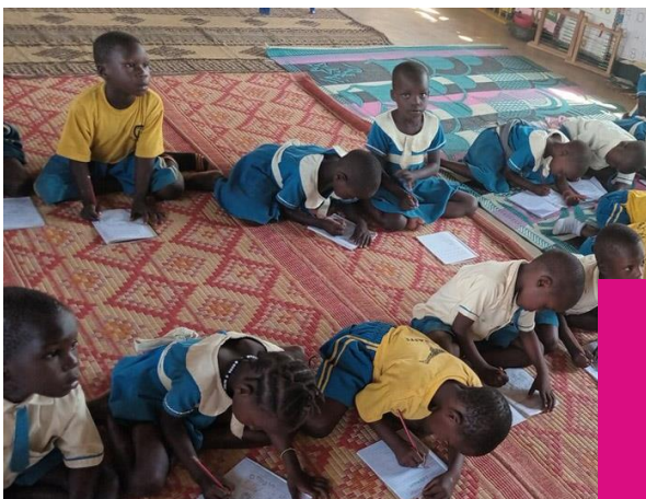
Children practicing writing in a classroom built by Plan International.

Additionally, 6,000 children in Plan's sponsorship programme received educational materials such as exercise books, pens, handwriting books for young students, and pencils, helping to support their learning and future career prospects.