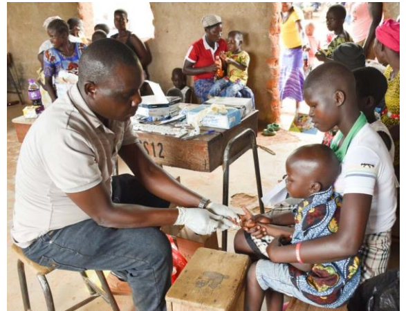
Health worker screening community members during a health camp.

Additionally, 48 parents were trained in sexual and reproductive health, menstrual hygiene, and soap-making. This training aimed to boost their income, improve hygiene practices at home, and empower them to advocate for better health in their communities.