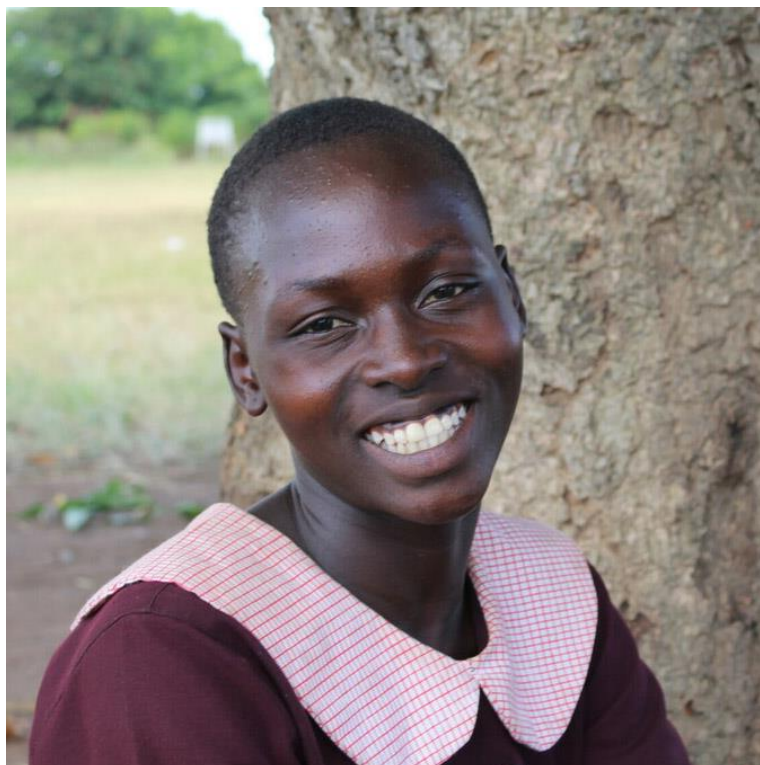
Member of Plan's sponsorship community.