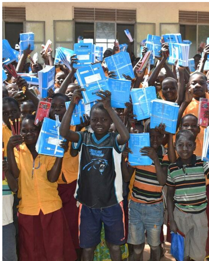
Children with books under Plan's Raising Project.