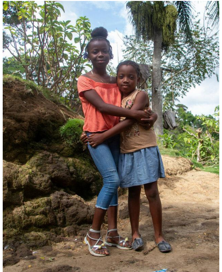
A safe environment is key for Sud-Est families.

By empowering young people, the Sud-Est community is working to make positive changes.