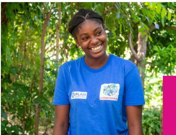
Young women are empowered with a green economy.

This year, 2,000 households learned about the use of green charcoal and improved stoves. In the community, 200 young women trained in green charcoal production techniques, and four innovative youth-led initiatives strengthened community resilience and promoted youth participation.