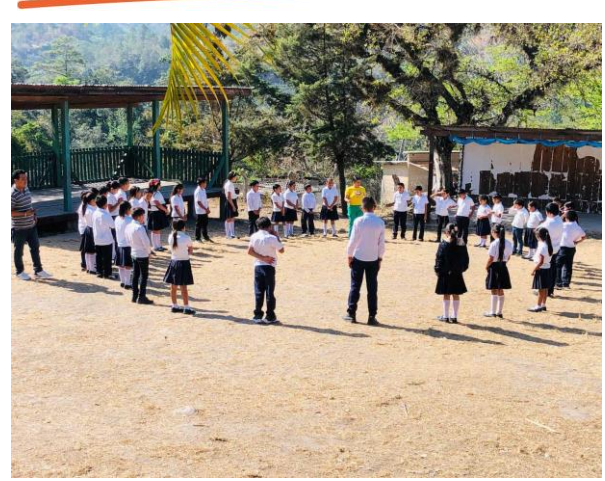
Young people strengthen their knowledge of health and rights.

young people learnt social and life skills