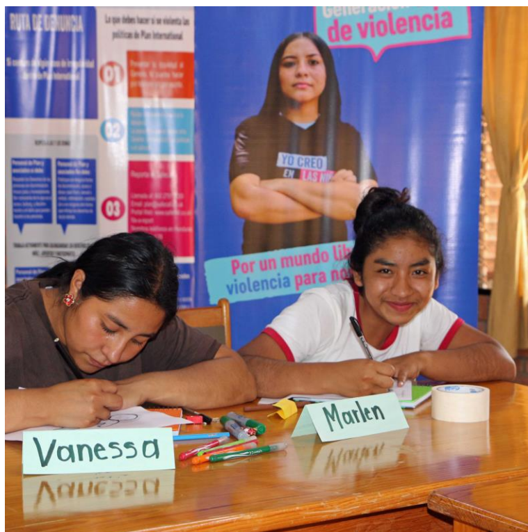
Pupils participating in My Safety Net activity.