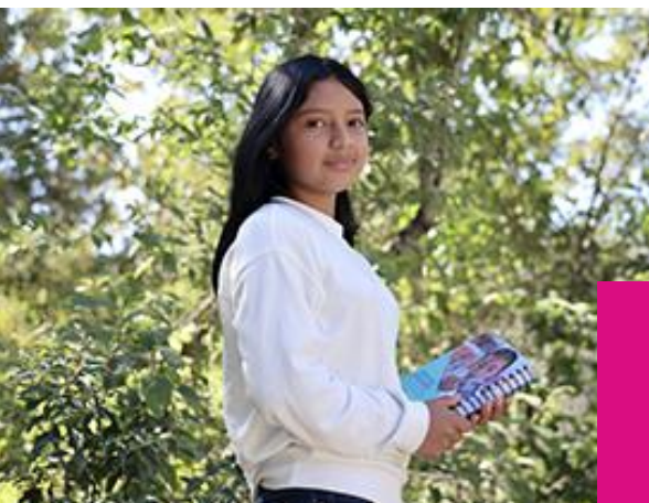
A reading culture empowers youth with knowledge and imagination.