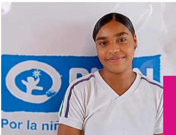
Empowering girls, empowering societies.

The participants have generated positive reflections on gender stereotypes in their families and communities. We have supported young family members to identify the types of violence that are part of these stereotypes like sexual violence. The mixed-participation of community members enabled an easy transition and practical approach to everyday issues related to gender norms, and gender-based violence. A sense of safety and belonging is crucial for the healthy growth of every child.