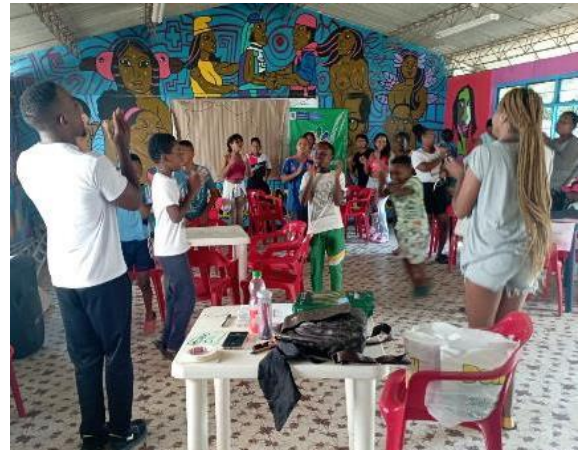
Consultations for local youth empowers them to raise their voices and demand change.

Through this project focused on civil action, Plan International empowers the organisations by creating enabling environment and create a space where advocacy can be carried out. Out of four citizen advocacy agenda, one was also created for young people and their needs. We focus on identifying negative gender norms in the society and seek their transformation through actions.