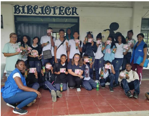
Group of participants after the film screening.

people participated in creating advocacy agenda