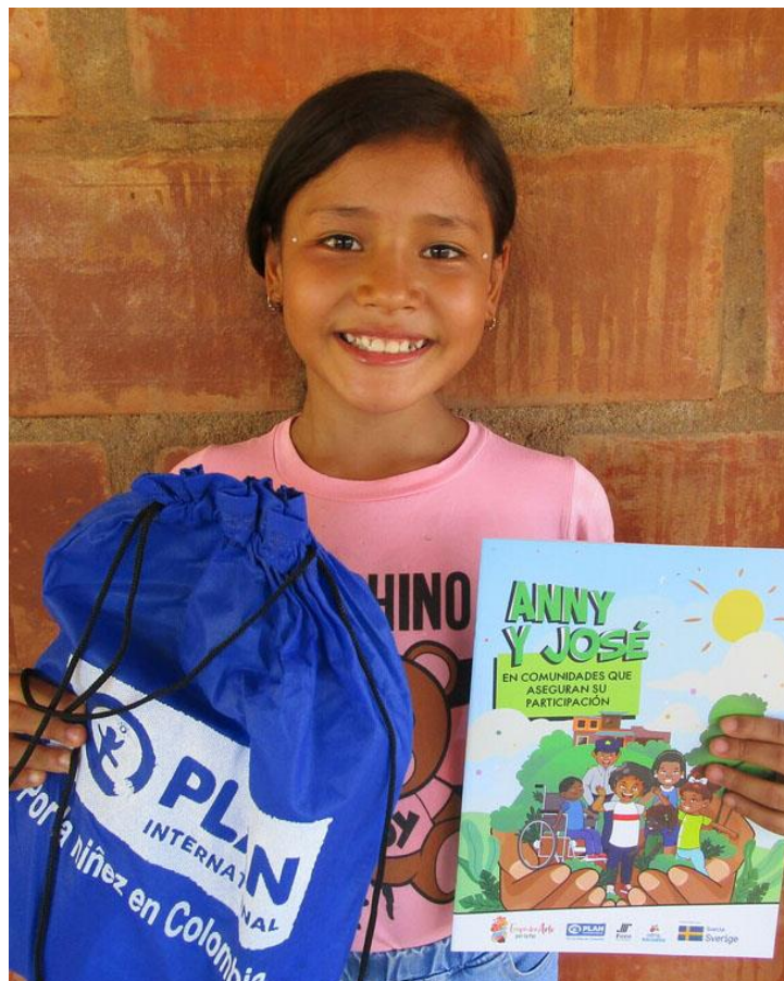
Access to educational kits for every child.