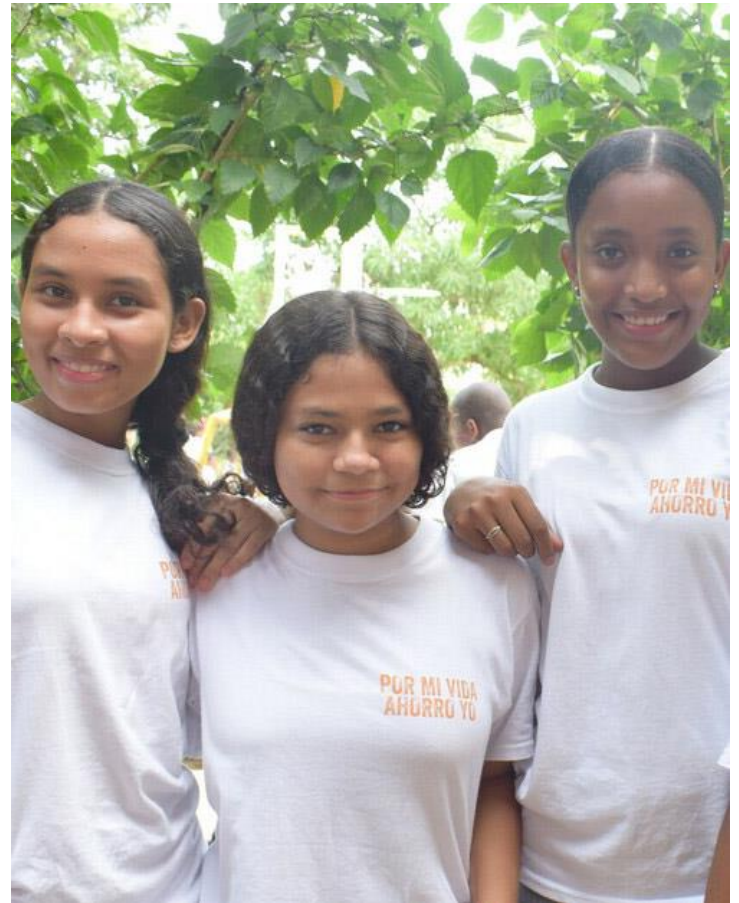
Access to educational kits for every child.

This year, we organised film screenings to educate and empower the youth about gender equality. We also provided educational kits to reduce barriers to school access. Additionally, young boys and girls from the communities participated in Colombia's Hay Festival as we carried out actions to promote reading and writing habits among children and share their stories with international writers.