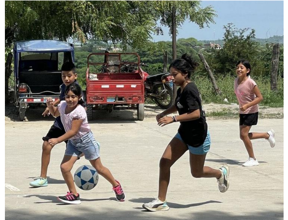
Girls participating in mixed-gender sports activities.

As a result, more children and young girls are aware of gender-based violence and its associated risks. Young girls and women now feel more empowered to make decisions about their lives.