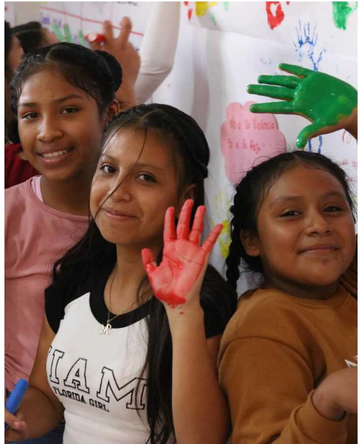
Girls at the emotional attention sessions.