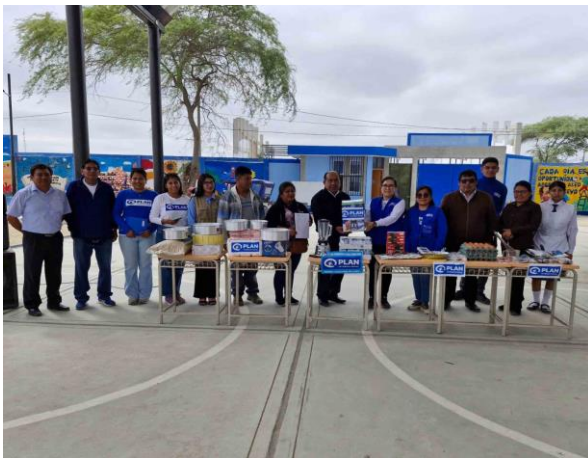
Delivery of material and equipment to a school for students' technical training.

1,204 children and youth trained to identify violent situations