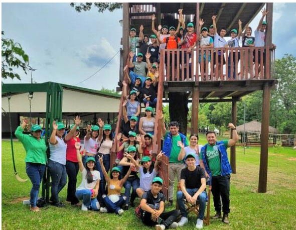
Everyone deserves the autonomy to make decision for their own lives.

Young women launched businesses with seed capital