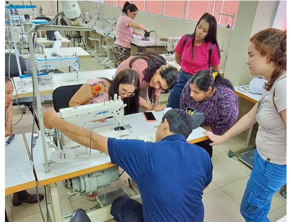
Basic concepts of innovation and green economy as a key part of the intervention.

Our youth labor insertion program fosters economic participation by promoting entrepreneurship and supporting access to quality jobs. In addition to technical training and innovation, we offer leadership workshops that build life skills, self-esteem, and peer support.