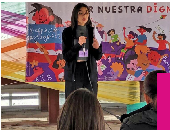
Leadership workshops empower the youth in assuming positions of authorities.

Through this project, Plan International encourages children, adolescents, and youth in all their diversity to make autonomous and informed decisions about their bodies and lives. Parents are provided with the necessary guidance to assist them in challenging the cultural stereotypes present in their lives and environments. Across other levels, training workshops for institutional authorities on sexual and reproductive health awareness enable them to offer guidance to youth participating in adolescents' clubs. Through sessions, on sexual and reproductive rights, life planning and STDs, and mental health, 366 adolescents were empowered to make decisions about their life, last year. We also aim to create spaces for dialogues within families to reduce the stigma associated with these topics.