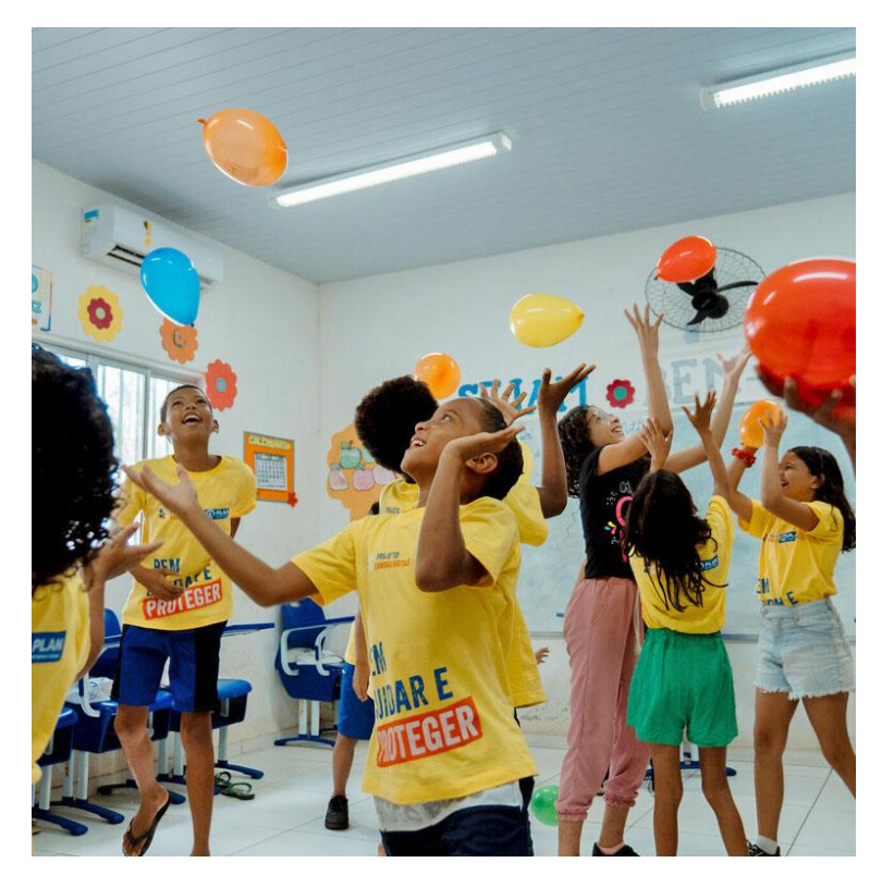
São Luís is providing a safe place for children to grow.