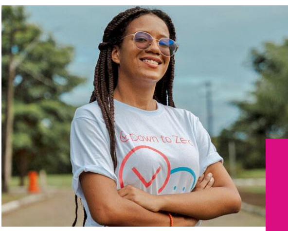
DtZ promotes youth and community-driven advocacy and political influence.