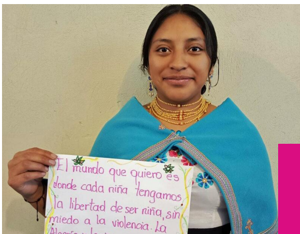
150 adolescents and young people make up the Because I Am A Girl movement.