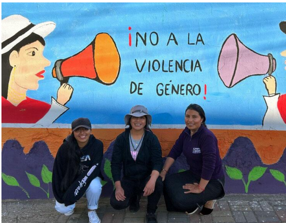
Participating in the Day of Non-Violence.

138 of the scholarship winners are girls and young women