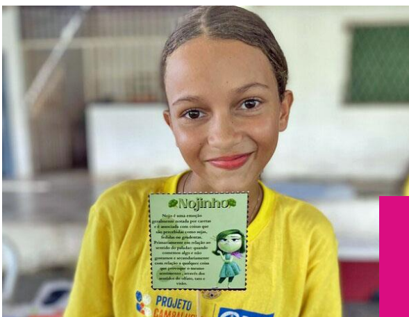
A stronger protection network helps ensure that children's needs are addressed.