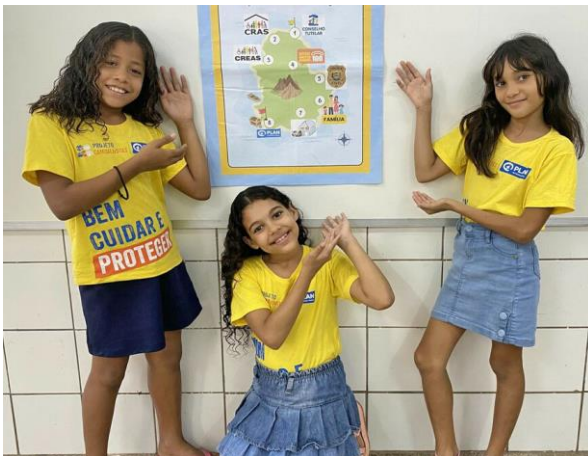
A welcoming environment encourages children to discuss their feelings and experiences.

324,006 people were reached with project campaigns