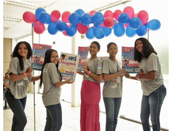
Girls are empowered to become community leaders.

In addition, the girls developed advocacy campaigns on early pregnancy, sexual harassment, and girls' rights, reaching thousands of people and creating change in their community.