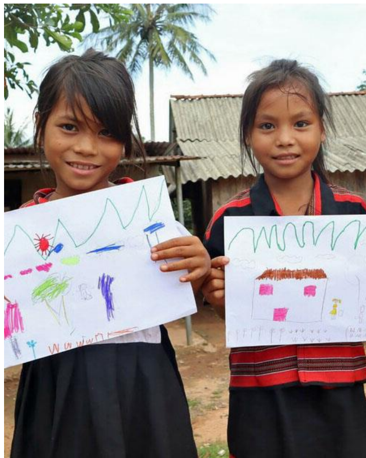
Sponsored Children show off their colourful artwork.