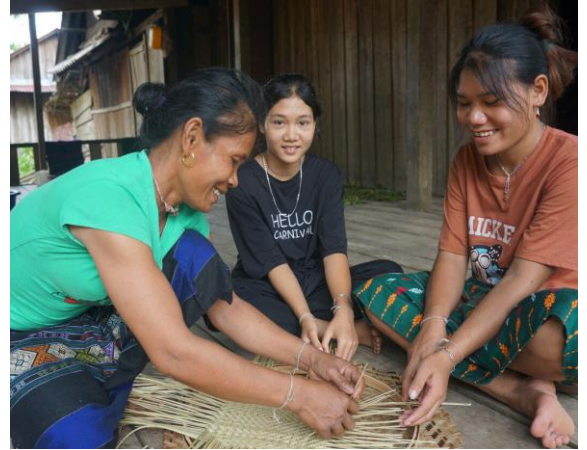
Members of Quang Binh’s bamboo and rattan collective.

Powered by 85 parents and 150 teachers, 29 schools offered career days, bringing in local artisans or businesses to discuss possible career paths with young learners.