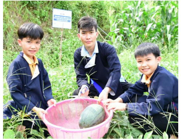
640 children learned sustainable skills in farming and livestock management.

Powered by what they've learned in these workshops, 256 young people, including 150 women, were able to get loans to jump-start their own small businesses. Participants also received material resources like seeds, fertilisers and tools.