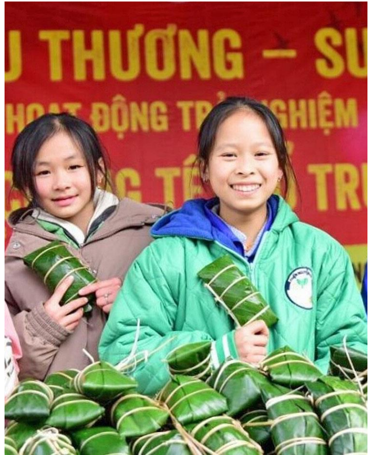
Two girls in Ha Giang celebrate the Tet festival.