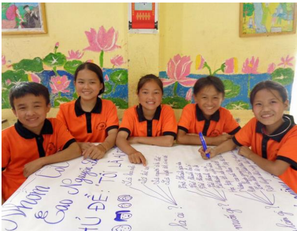
Student activists meet as part of a Champions of Change brainstorming session.

young people learned new vocational skills