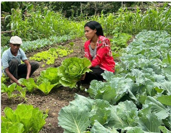
A community vegetable garden offers additional food sources.

people with visual impairments learned about Talkback applications on their phones