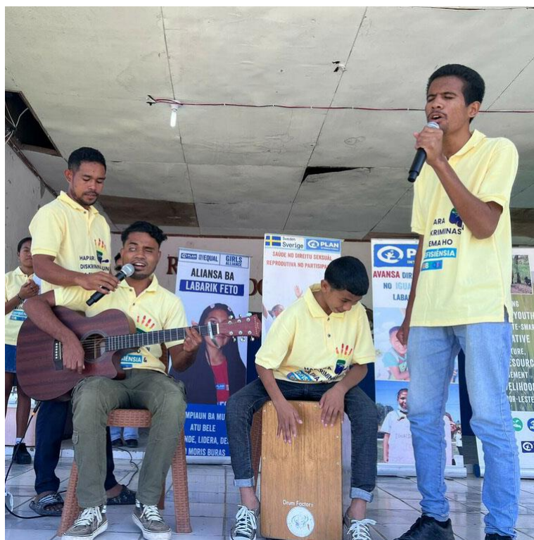
Music campaign by youth in Ainara.