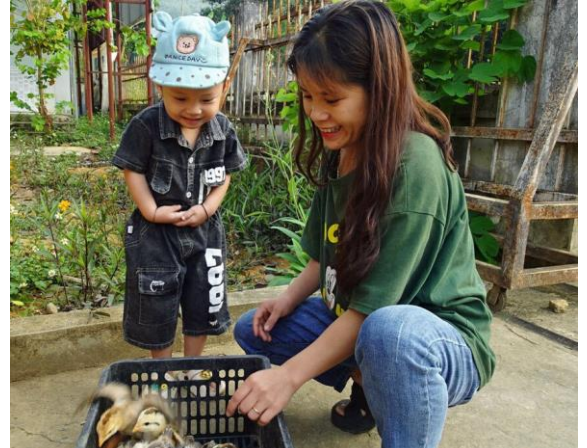
Sponsored Children get to know their new baby chicks.

Second, 1,480 children under the age of ten, including 759 girls, met monthly in 46 new Playing and Reading groups. Here, these budding bookworms could participate in educational, entertaining reading activities. Today, these students are starting school with more confidence, powered by their months of reading practice.