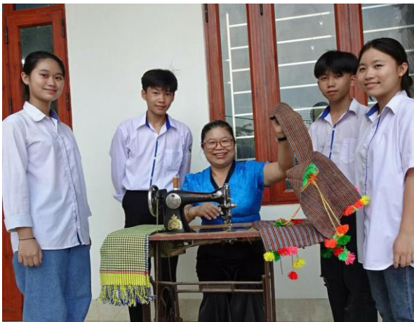
Students learn how to make handmade craft products out of recycled materials.

1,000 children are recovering from malnutrition