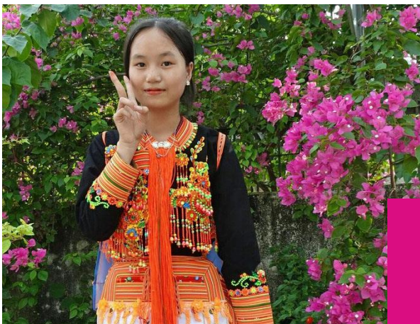
Trang visited a dried banana factory, where she learned more about running a business.