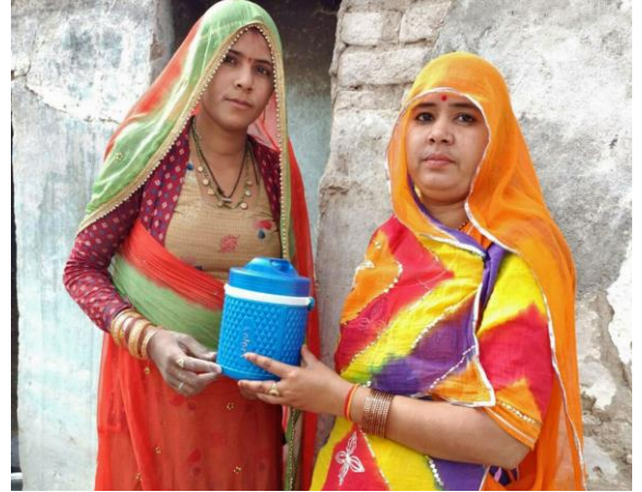
Beneficiaries of the 'MoM's Plate Project' received meals from local health centres.

The 'MoM's Plate Project' focuses on making nutritional resources easily available to expecting mums. We started by conducting training sessions with seven local healthcare workers focusing on the nutritional needs of pregnant women. Then, we worked with healthcare workers to survey 215 pregnant women in the region to learn more about their food habits, lifestyles, socioeconomic conditions and health issues. When we learned that 101 expecting women were malnourished, we connected them to healthcare providers for regular check-ups and daily meals.