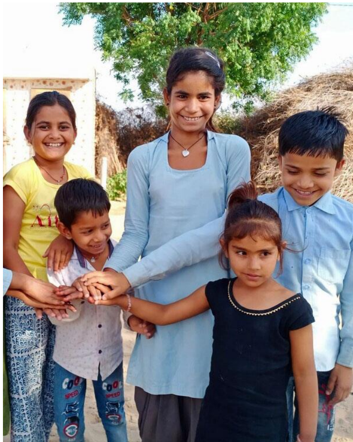
Sponsored Children in Lunkaransar.