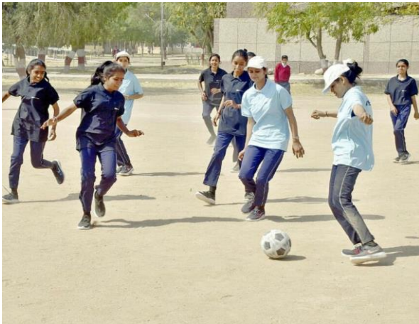
Sponsored girls shattered gender stereotypes through playing football.