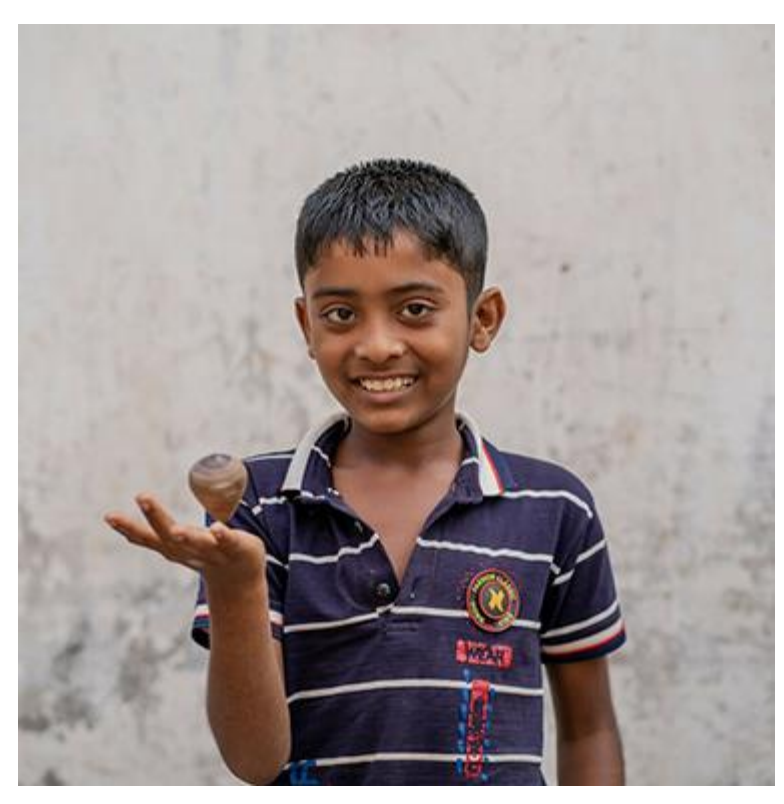
Early childhood development improves growth.