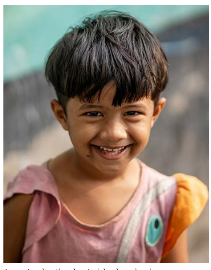
Access to educational material reduces barriers.