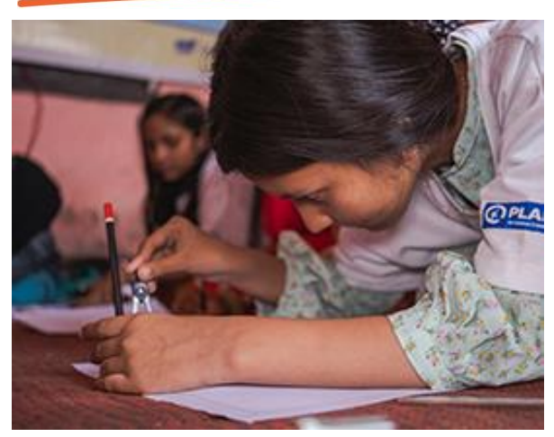
Community activities empower the youth.