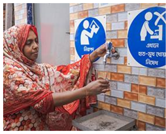
Safe drinking water facility was installed with the bathing space.

The project engaged community members in planning and decision-making and ensured that it was a gender-sensitive and inclusive design. It also provided leadership opportunities for girls to advocate for their needs.