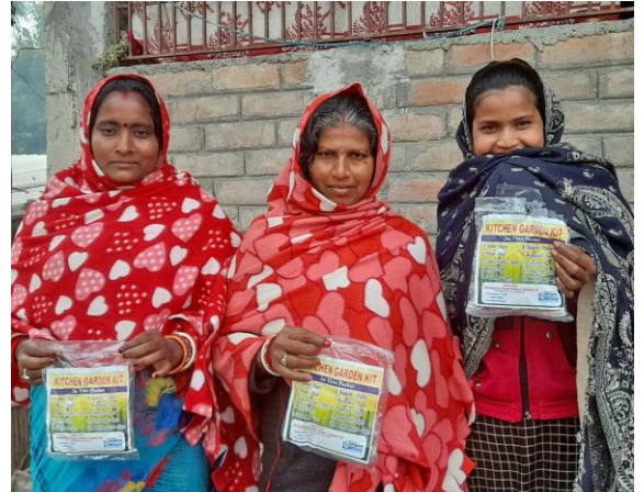
Women with packets of vegetable seeds for their new home gardens.

In partnership with local government, we connected with 22,052 Patna residents to talk about nutrition. 4 schools are equipped with clean water, making sure that every student is hydrated and healthy throughout the school day and beyond. 2,500 families are now planting home gardens with the help of new vegetable seeds, and 2,655 local parents have recipes to prepare delicious, nutritious meals.