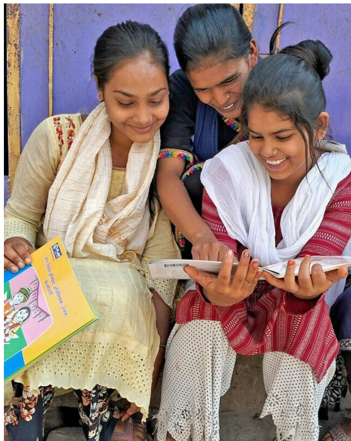
Sponsored girls read a booklet about their rights.

Another key focus has been disaster preparedness: millions of people in Bihar are already experiencing the effects of climate change, such as floods, drought and earthquakes. 6,212 students now know more about how to stay safe during a natural disaster.