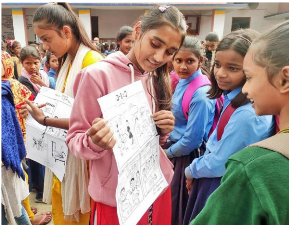
106 students made educational comics about safety and children's rights.

Children now have clean drinking water at school