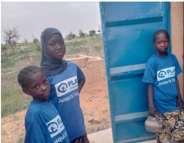
Young girls using their new latrines.