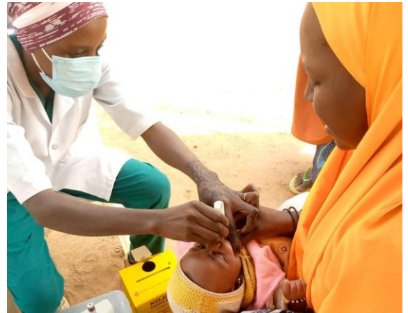
A nurse administering the dose of polio vaccine.

Safe space networks run by 21 local youth groups have enhanced skills and knowledge. In addition, 200 adolescents have formed 20 "Future Husband Clubs," equipping themselves with essential knowledge about reproductive and maternal health services. Through health fairs, both women and children are learning about the preventive and curative aspects of health, contributing to more informed communities. At institutional level, 50 officials have participated in awareness session to develop policies and acts in favour of development and well-being of the youth.