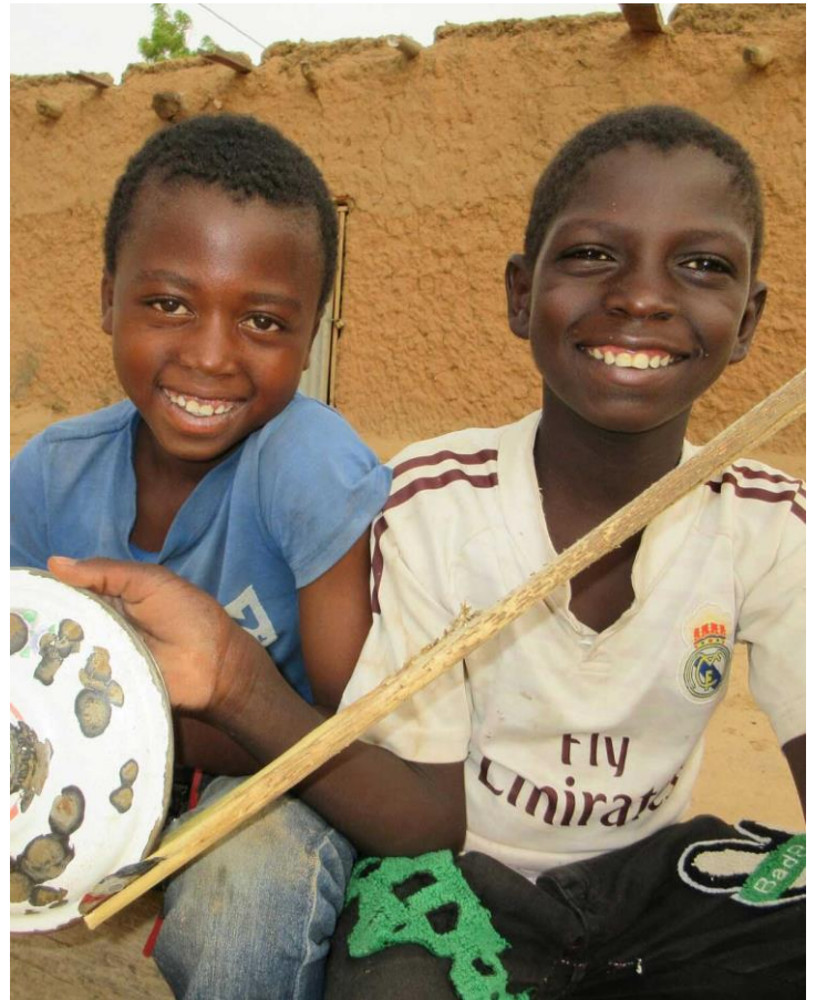
Young boys play their favourite game.

Through accelerating schooling programs, school materials, safeguarding measures and child protection advocacy work, we work together with parents, local government and civil society to raise awareness of the harmful consequences of child marriage and transform harmful gender norms. Moreover, hundreds of young boys and girls have their birth certificates now. It has enabled them to access basic provisions and higher education.