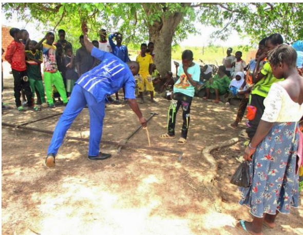
Participants being trained in soybean production.

Children were trained in entrepreneurship activities