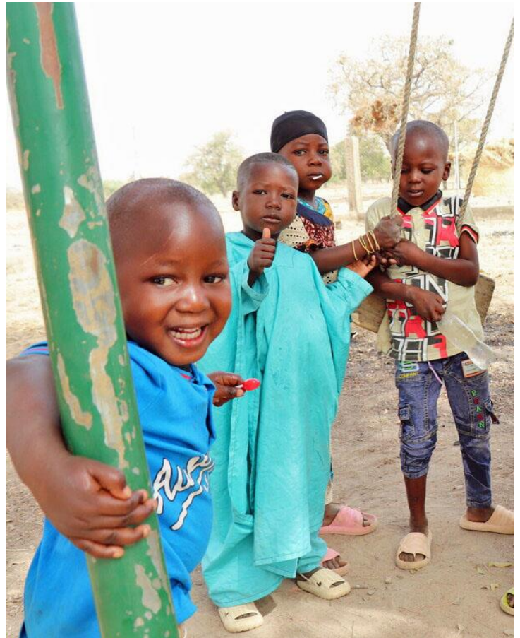
Children participating in Plan's initiatives.

In partnership with the community and government, Plan aims to enhance employment and educational opportunities in Ziro. Our market gardening initiatives have provided gardeners with 36 watering cans, 36 hoes, and four rolls of wire netting. Additionally, 257 children were trained in soybean and poultry farming, creating new entrepreneurial prospects.