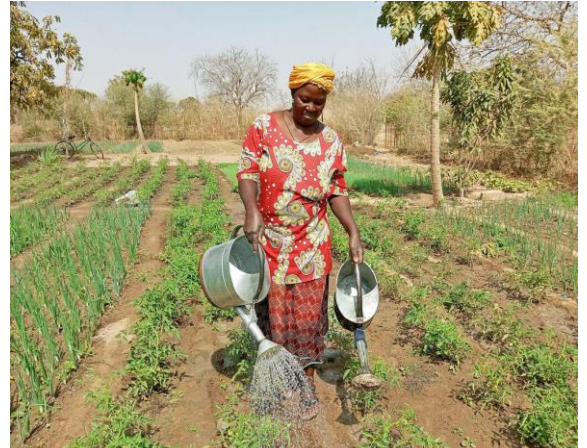
A beneficiary watering onion plants in the garden.

Additionally, the market garden production capacities of the 36 gardeners have been strengthened through the provision of fertilisers, seeds and gardening tools.