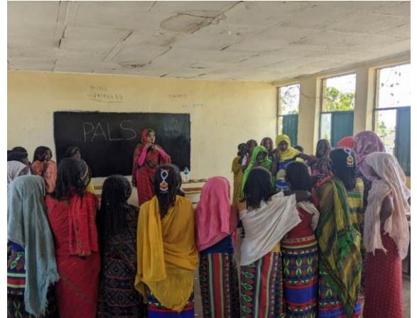
Parents and young people participating in life skills trainings.

531 children accessed age- and sex-appropriate, culturally relevant, and disability-inclusive learning and recreational activities in child-friendly spaces at schools.