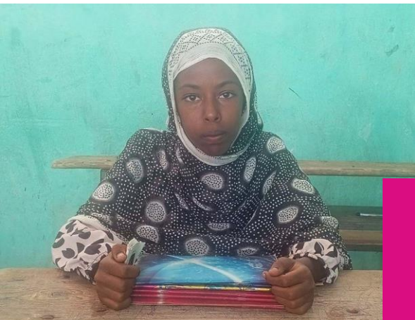
Learning Through Play promotes play-based learning.