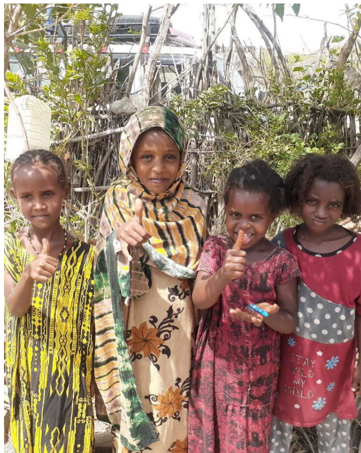
Accelerated learning bridges gaps in learning.