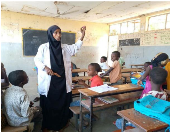
Children studying in a classroom.

children provided child protection services