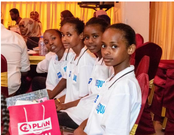
Girls participate in a community meeting about gender equality.

women and girls received menstrual hygiene supplies