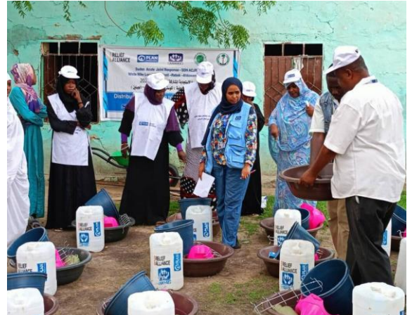
Community members in Guli work to distribute water and sanitation kits.

As part of our efforts to reduce the spread of water-borne illnesses like cholera and diarrhoea, we helped displaced communities and a local hospital repair 24 latrines to make them more sanitary. Additionally, 1,400 households now have our Water, Sanitation and Hygiene (WASH) kits.