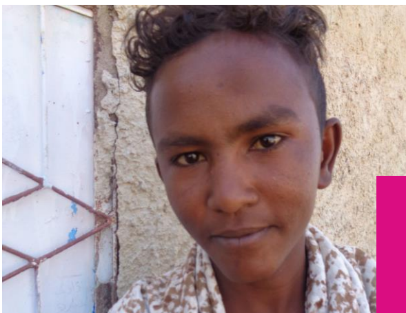
Munzir participated in workshops about gender-based violence.